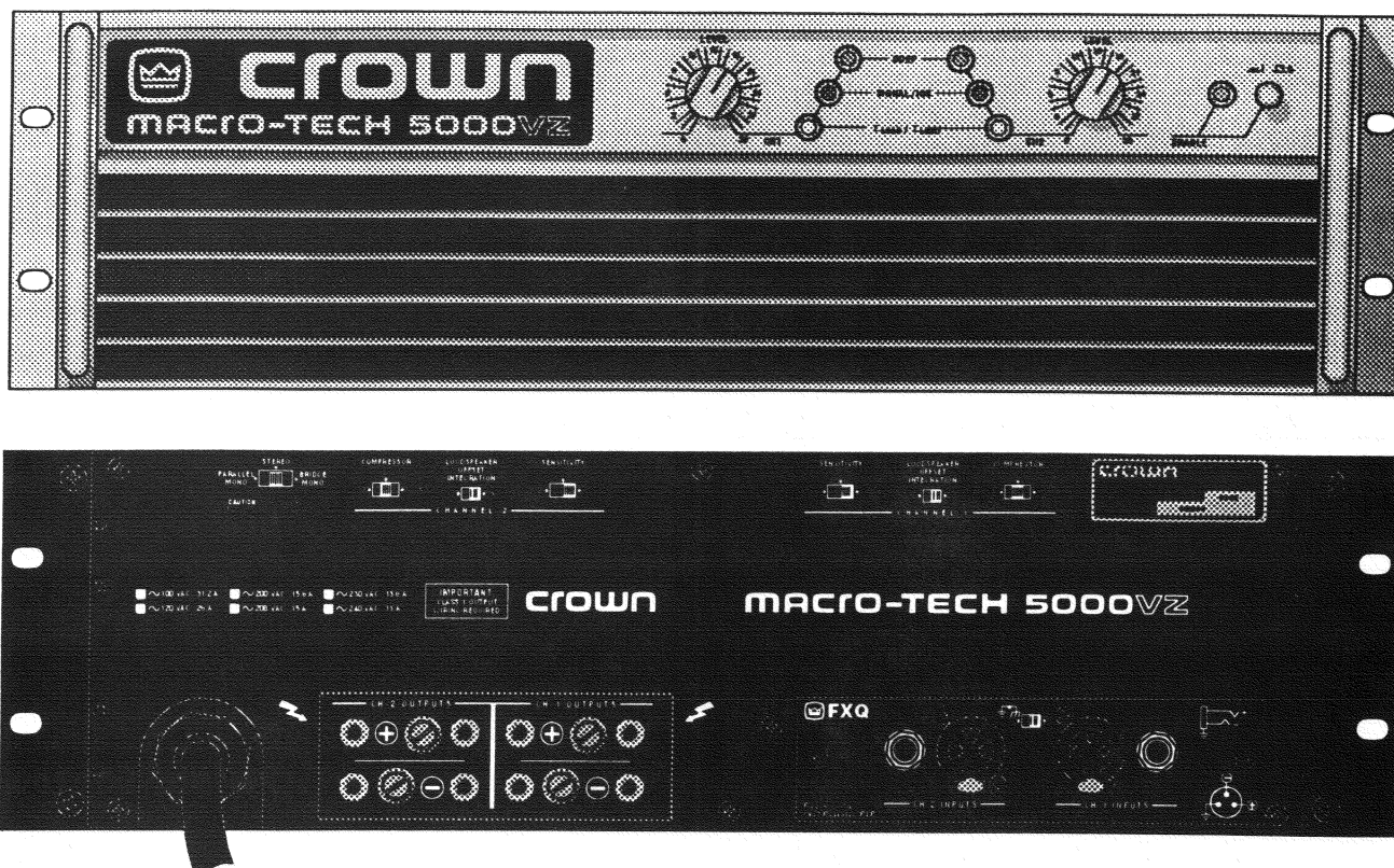
Fig. 1.1 Macro-Tech 5000VZ